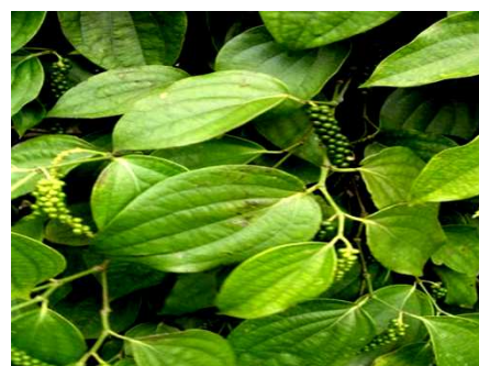
Fig. 2: Piper nigrum plant (Indian black pepper) with immature pepper corns.

flowering vine (Figure 2) mostly cultivated for its fruit. Its fruits are used to produce black, white and green peppers (Figure 3) which are valued due to the presence of an alkaloid piperine along with its isomers.