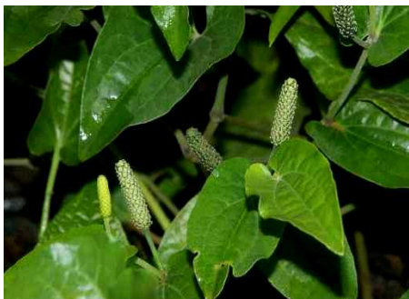
Fig. 4: Indian long pepper plant with immature corns.

properties P.nigrum is medicinally important [9] and is used to cure digestive and respiratory disorders [10-12]. P.longum (long pepper) is also a flowering climber (Figure 4) cultivated for its fruit and root. This plant is source of drugs pippali and pippalimulam which are prepared from dried ripe fruits (Figure 5) and roots of P.longum are well known medicines for respiratory tract diseases like asthma, bronchitis and cough. The West African black pepper ( P.guineese ) is important as flavourant and its different parts are used as internal medicine for curing bronchitis, gastric ulcer, rheumatism and viral diseases [13].