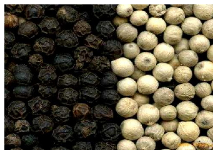
Fig. 3: Black and white peppercorns from Piper nigrum .

Black pepper is ground from dried whole unripe fruit, where as white pepper is ground from dried ripe fruit that has had the outer layer removed. People use black and white pepper for stomach upset, bronchitis, malaria, cholera and cancer. Because of these