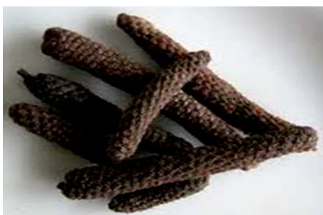
Fig. 5: Mature dried corns of long pepper

Govindrajan [14] reported that pungent quality of P.nigrum and P.longum is due to piperine content and other compounds role in imparting pungent nature is very negligible. It is interesting to note that these two species are important components in Ayurveda medicine, which is the ancient Indian medical system for different problems. Nearly 60% of all traditional Ayurveda medicine contains some special blend of ingredients, which include P.nigrum in the blend. In addition, P.longum is being used in 324 Ayurveda formulations and it is one of the ingredients of Trikatuchurna which is used for bronchitis and asthma. Fruits and roots of P.nigrum and P.longum contain a number of constituents including volatile oil, alkaloids, isobutyl amides, lignans and esters etc. Out of these, piperine is the primary constituent and reported to be significant in imparting medicinal value for these spices.